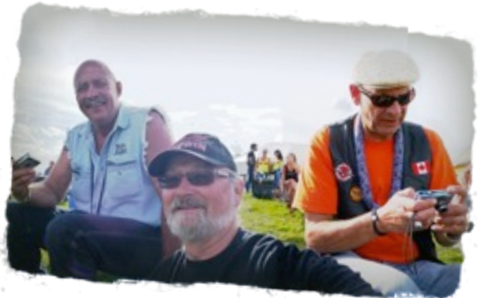
Big Al, Drifter and Sagebrush at the Aug 27th Bikes & Bulls Show and Shine/Rodeo in Airdrie.