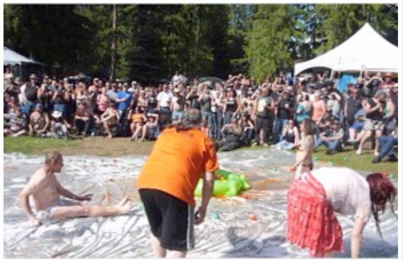
It's all about finding a ball with a winning number on it . . . that and keeping your skivvies on.